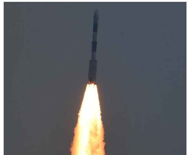
ISRO launches ASTROSAT, first space observatory

27 October – Finance Minister Arun Jaitley launched the e-Sahayog of the Income Tax Department. The facility will allow the tax office to remotely notify the payer in case of mismatch in filings.